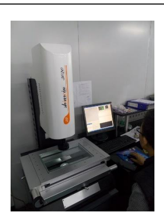
2.5 Dimension Projector tester

All products will be 100% tested before shipment; And our factory is equipped complete testing devices for our production inspection!