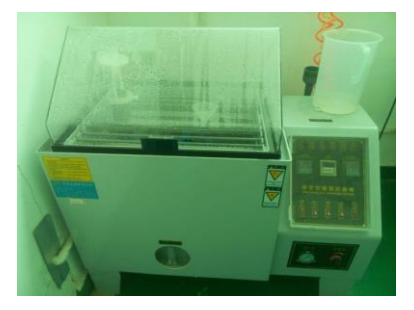
salt spray tester